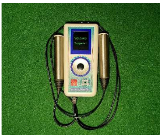
ZAPPER VOLCANO 4