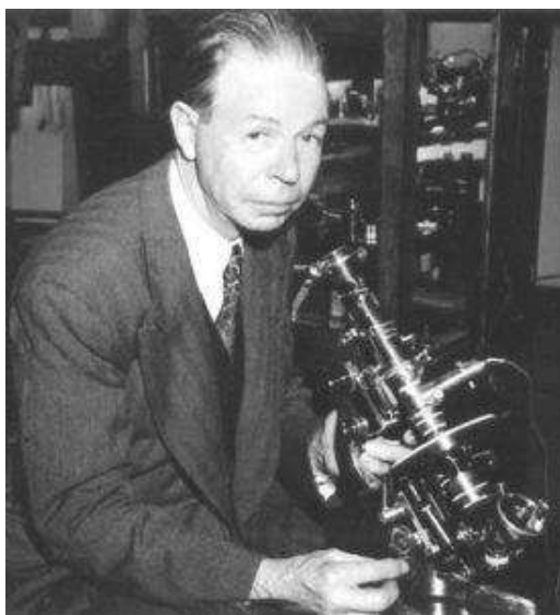
Doctor Royal Raymond Rife, Dr. Rife's Universal Microscope

The solution to numerous “incurable and chronic” health problems is not a chimera, as Dr. Royal Raymond Rife proved back in the 30s of the 20th century. In 1920, a young American scientist discovered the “incurable/chronic disease” virus, isolated it and injected it into 400 rats. All experimental animals were infected and then cured. Rife showed that any bacterial or viral disease can be defeated if it is affected with a certain frequency. Everything has its own unique vibration frequency.